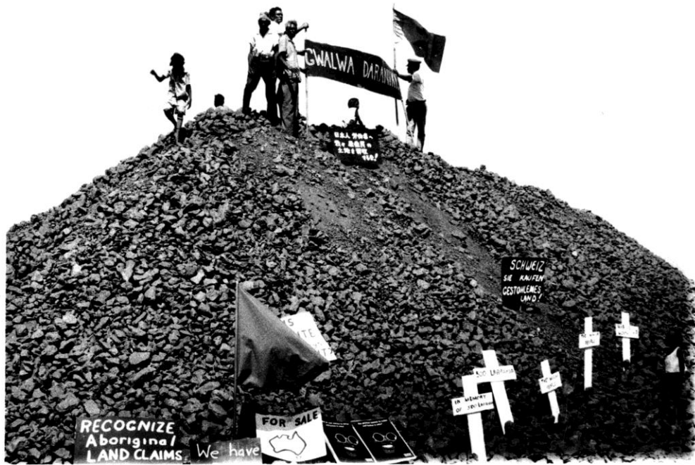
Plate 1: (Above) On top of the iron ore stockpile, Darwin wharf, 14 July 1972.